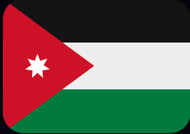
ABDELRAHIM Y. ATTIEH