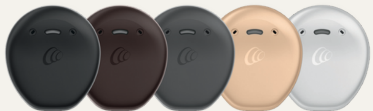
Black Chocolate Brown Slate Grey Sandy Blonde Silver

Designed for active lifestyles, the Cochlear™ Nucleus® Kanso® 2 Sound Processor combines our latest connectivity features and proven hearing performance technology 1-4 with a simple 4 and durable 5 all-in-one design , giving your patients the freedom to hear wherever life takes them.